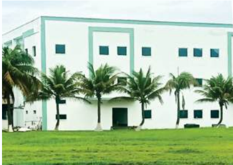
PELLETS AND DC GRANULES PLANT AT VIZAG